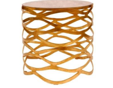
Design named Döngü Sehpa by Deniz Tunç<sup>7</sup>