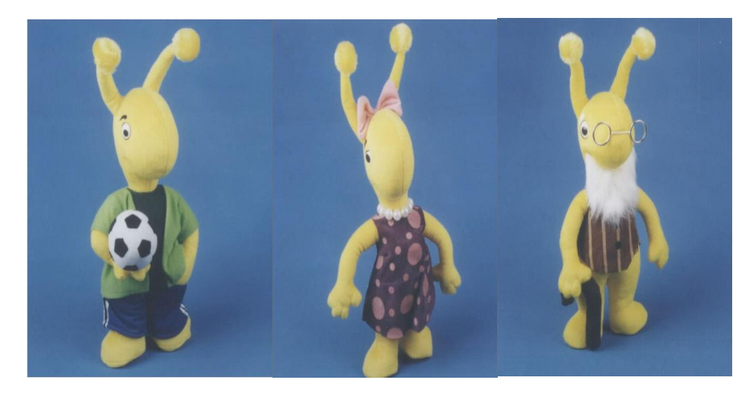
3 Dimensional Mascots made by Toy Designer Fatoş İnhan using both Fabric and Plastic Materials