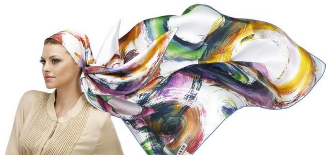
AKER brand unregistered scarf design<sup>5</sup>

AKER, which is the leading scarf manufacturer of Turkey, publishes catalogues proving the designs belong to itself instead of making registration application for scarf designs, tens of which are designed seasonally. In the lawsuit that is brought upon the imitation of the scarf design below which was in 2011 catalogue, the court decided that unregistered scarf design is of a beautiful artistic quality and can benefit from copyright protection and decided also that the imitation company's activity constitutes unfair competition violation.<sup>4</sup>